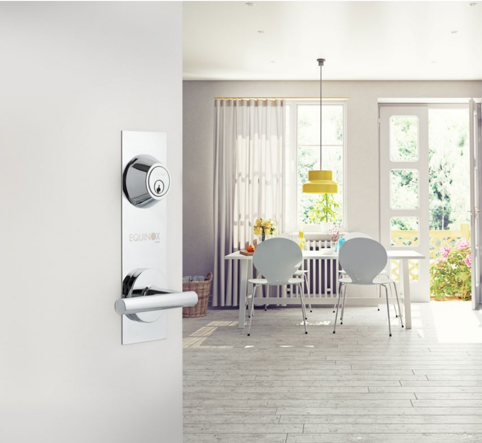
CUSTOM ESCUTCHEON ETCHING WITH BERGEN LEVER & DEADBOLT IN POLISHED CHROME