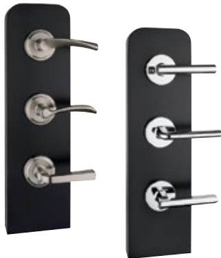
MOUNTED DOORWARE PRODUCT SAMPLES