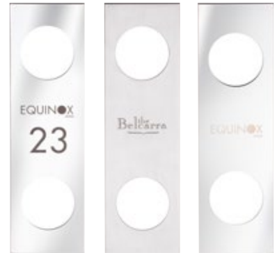
CUSTOM ESCUTCHEON ETCHING