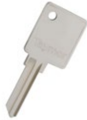
CUSTOM LOGO KEYS