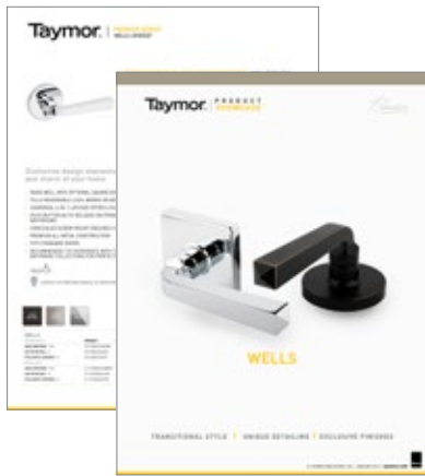
CUSTOMIZED DOCUMENTS & SELL SHEETS