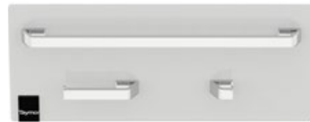
MOUNTED BATHWARE PRODUCT SAMPLES